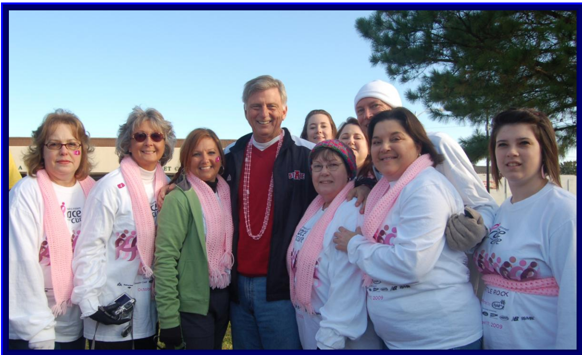
Several members of the White County Legal Support Professionals “raced for the cure” and had their photograph taken with Governor Mike Beebe.